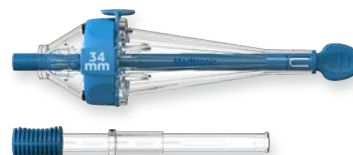
Evolut PRO+ Loading System