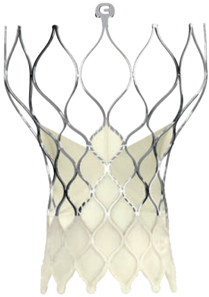
Evolut PRO+ 23 mm Valve