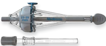
Evolut PRO+ Loading System