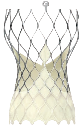
Evolut PRO+ 29 mm Valve