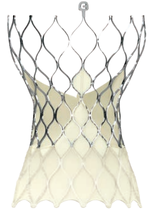
Evolut PRO+ 34 mm Valve